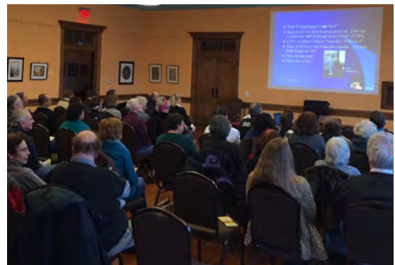
Master Beekeeper Bill Mondjack of Mondjack Apiaries presents, "What's Happening to the Bees: A Local Perspective" at Nurture Nature center as part of a two-part series looking at the health of bees nationally and locally.

Building on its successful model for community dialogue forums, Nurture Nature Center, Inc. (NNC) produced a yearlong "Risk to Resiliency" series of monthly adult and family educational programs about local environmental risk topics here in the Lehigh Valley. This series of programs held at NNC's facility in downtown Easton integrated science education, artistic approaches and community dialogue to engage a broad cross section of the community in learning about timely and important environmental risk topics - such as extreme weather, air quality and asthma, and local food access - that have been documented as areas of concern in the region.