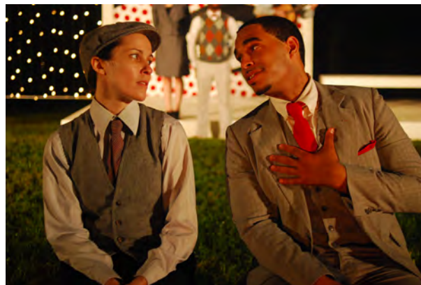
A scene with characters Viola and Duke Orsino in the Sixth Annual Allentown Shakespeare in the Park’s production of “Twelfth Night”.

The sixth annual Allentown Shakespeare in the Park was held August 9-11, 2013 with five performances of Shakespeare’s classic comedy “Twelfth Night.” Admission to productions and all events was free of charge to the public.