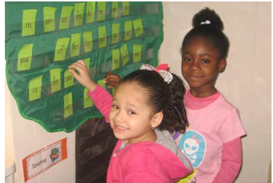
Pre-K children picking out sight words, to make a sentence.