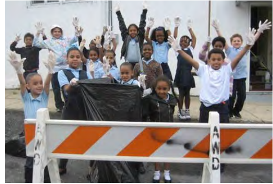
The Elementary children doing a Neighborhood Clean-Up.

In the past year St. Luke's Neighborhood Center served 78 youth from the community. Of these 78 youth, 18 were enrolled in the preschool program, 45 in the after school program and 15 in the teens program. From this group of 78 youth, 30 regularly attended the 10-week summer program.