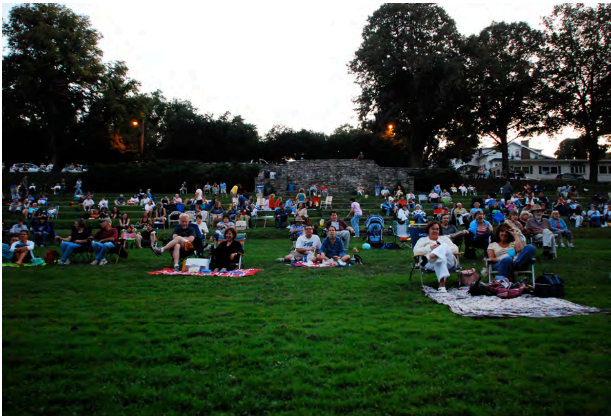
Shakespeare in the Park audience.

Housing counseling and education are essential components for preparing households for home ownership or a home improvement project by making clients more financially literate consumers. These programs are open to low and moderate income, individuals and families purchasing homes or rehabbing their homes in Lehigh and Northampton counties.